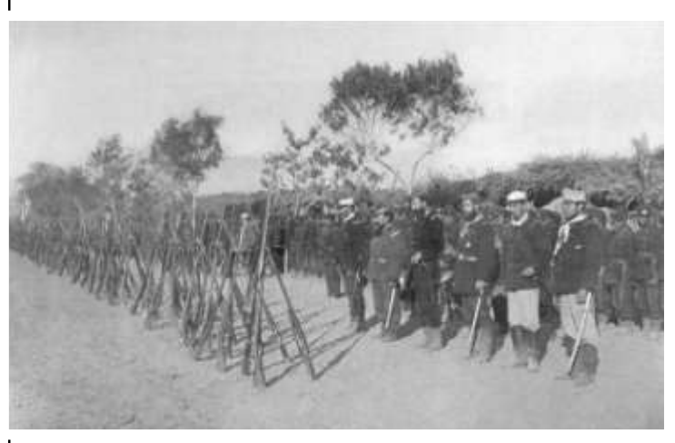
The Chilean Army preparing to invade Lima—January 1881

Chilean enterprises, which largely exploited the area, saw their interests at stake when Peru nationalized all nitrate mines in Tarapaca, and Bolivia imposed a tax increase on Chilean companies, backdated to 1874. When the Chilean/British owned Antofagasta Nitrate & Railway Company refused to pay the tax, Bolivia threatened to confiscate the company's property. In response, Chilean armed forces attacked and occupied the port city of Antofagasta on 14th February 1879.