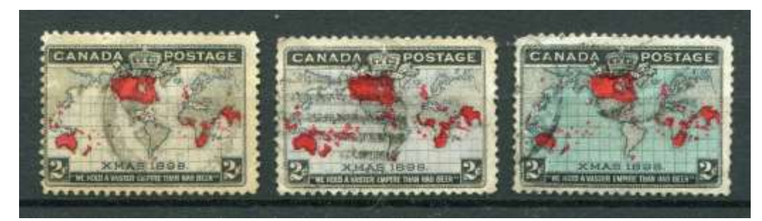
Contributed by Grey Loyer Hon. Secretary Maryborough Stamp Club (Vic).

These stamps can readily be found and vary in price from a few dollars for used copies to hundreds for Mint/MUH or Imperforate singles or blocks.