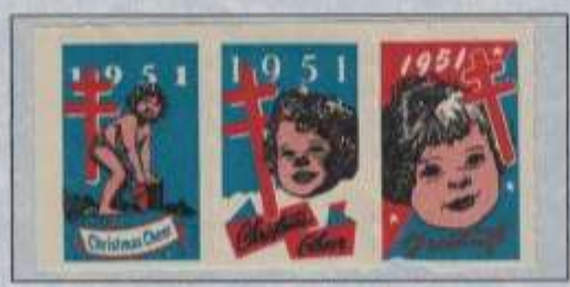
1951 x 3 designs alternate throughout the pane

From 1952, the Association began to issue "ALL YEAR ROUND" seals in addition to Christmas seals and these were continued until 1961.