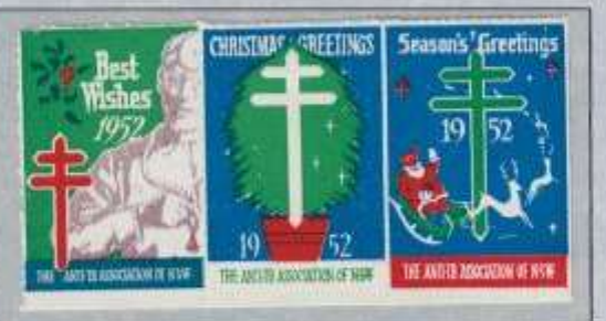
1952 x 3 designs alternate throughout the pane