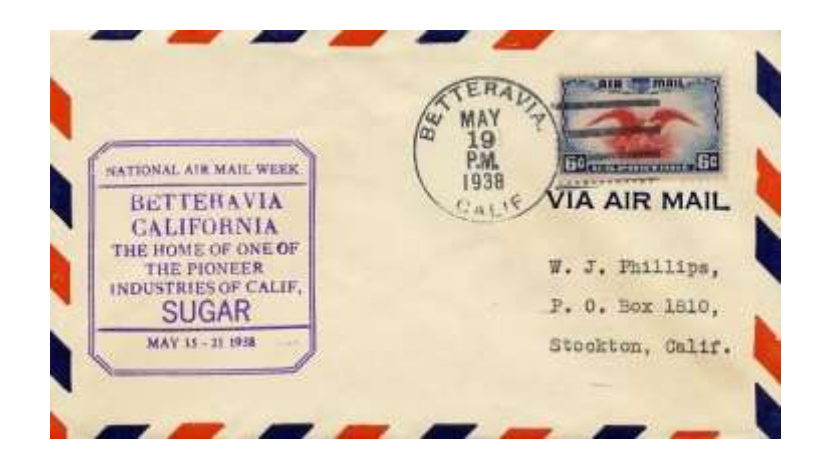
Over 16.2 million letters/covers and 9 thousand parcels were transported by air that week

On Thursday, May 19th over 1,700 special one-day-only flights occurred carrying these specially prepared air mail covers linking location to location. Forty-three special flights were made by women pilots. One special flight was made by the first black pilot to carry airmail. Grover C Nash flew a special one-day flight from Chicago via Mattoon IL to Charleston IL. Many local airports were dedicated during the week. Some special flights were delayed due to weather and only one of the special flights crashed.