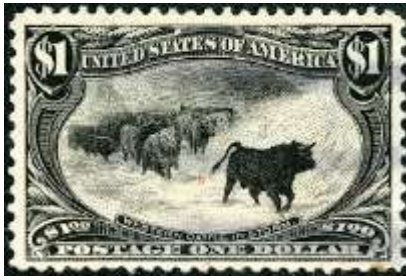
U.S. 1898 Scott 292 $1 black "Western Cattle in Storm"

Some consider this to be the most beautiful stamp of the classical stamp era. How about ever in the world? In 1934, the "Western Cattle in Storm" stamp was voted a close second by readers of "Stamps" magazine, just edged out by the Canadian "Bluenose".