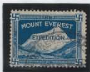
Used on mail Note :- Cancel

It was possibly made to raise revenue, and to spread publicity about the expedition or to "mark the missives" from this 1924 British Expedition to Mount Everest.