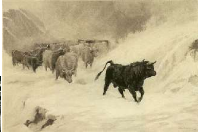
1897 "The Vanguard" by James McWhirter Western Highlands of Scotland

Some consider this to be the most beautiful stamp of the classical stamp era. How about ever in the world? In 1934, the "Western Cattle in Storm" stamp was voted a close second by readers of "Stamps" magazine, just edged out by the Canadian "Bluenose".