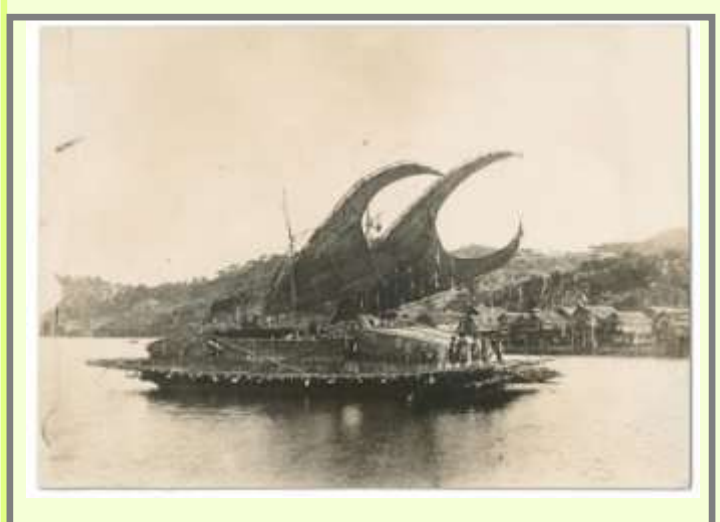
Print from original glass negative, inspiration for the lakatoi stamp design. Auctioned at Prestige Philately, Melbourne, 2007, AU$2415

sailed to the Gulf of Papua where they traded for sago, a diet staple extracted from the starchy core of palm trees. The sago, somewhat like tapioca pearls, prevented starvation when local harvests dried up or washed out