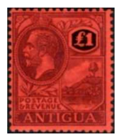
Antigua 1921-29 £1 purple and black/red, SG61. A very fine quality example of this attractive King George V stamp with original gum. Unusually well-centred for this stamp, which is rarely seen so fine.