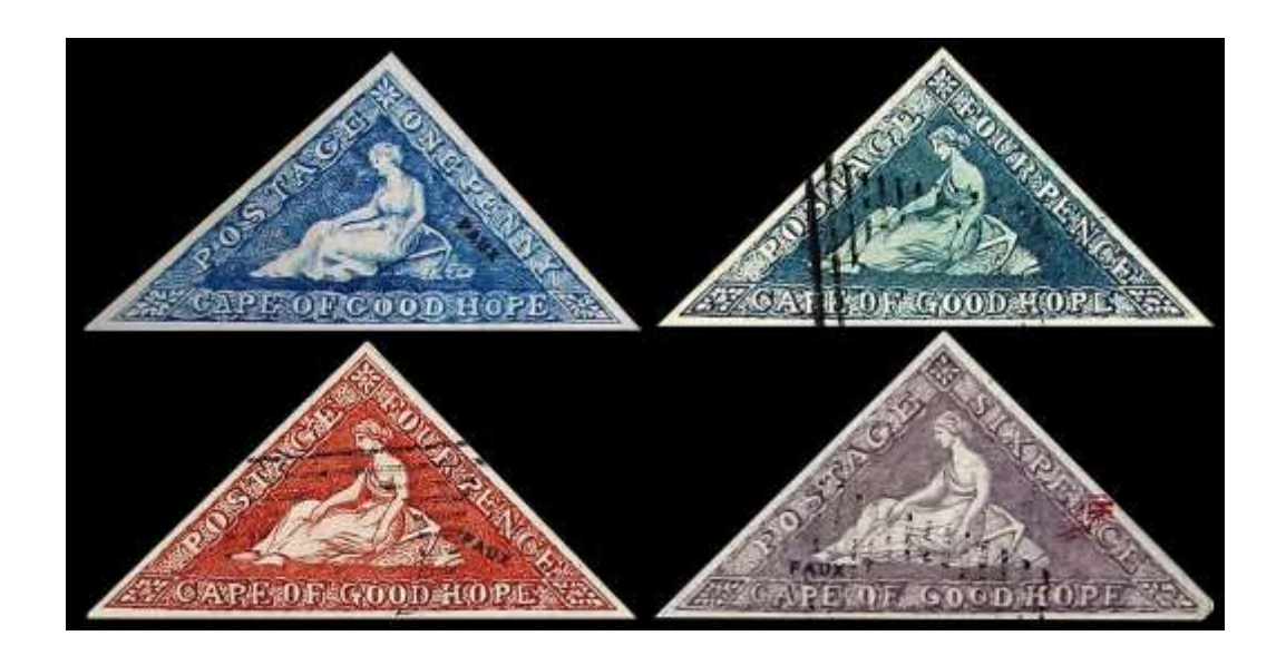
Above Some CAPE OF GOOD HOPE forgeries Note the first one with the short hair and the triangle off centre

Below FOURNIER DEALER SAMPLES An interesting item sent by Fournier to dealers. These are his "premier choix" items (some of his first choice forgeries)